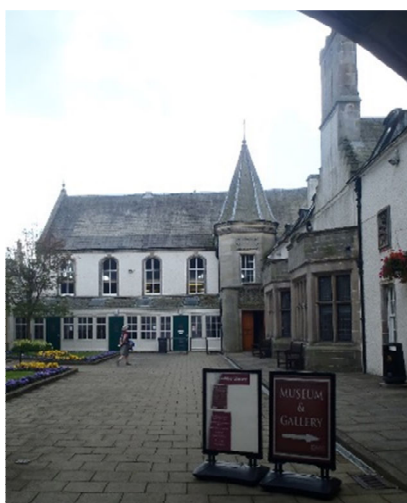
Courtyard of the Chambers Institution

Scottish Borders Council commissioned the Scottish Historic Buildings Trust (SHBT) to carry out a community consultation exercise to define an agreed Vision for the future use of the Chambers Institution in Peebles. SHBT has over 35 years of experience in finding sustainable uses for important buildings across Scotland and has worked directly with Scottish Borders Council on a number of projects in the Borders, including recent projects to secure the future of the Greenlaw Town Hall and the Haining estate, Selkirk.