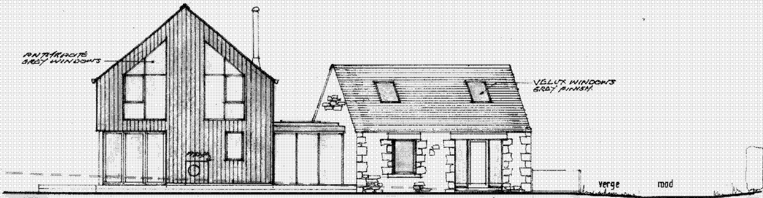
SOUTH WEST ELEVATION 1:100