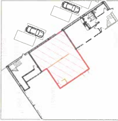
Site Plan Scale 1:200