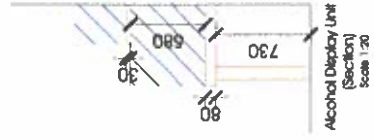
Alcohol Display Unit (Section) Scale 1:20