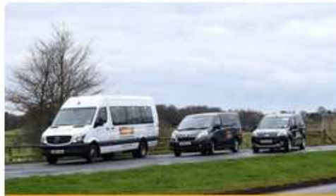
BUS TIMETABLES & DIAL-A-RIDE