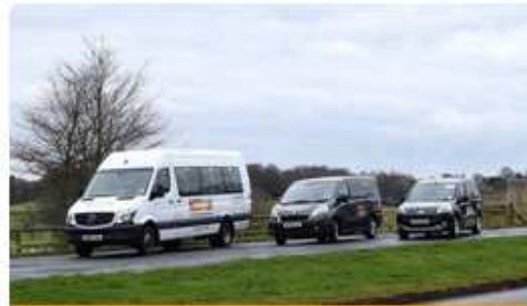
BUS TIMETABLES & DIAL-A-RIDE