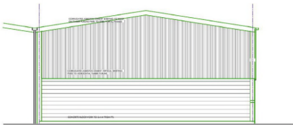
EXISTING SOUTH WEST ELEVATION

Scottish Borders Council Town And Country Planning (Scotland) Act 1997